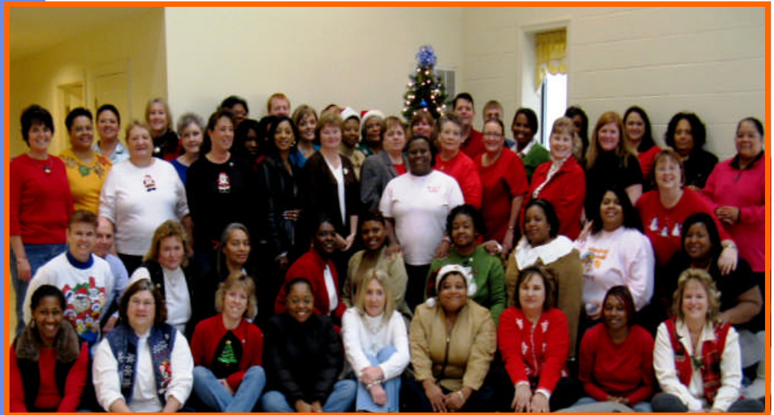
Hertford County Public Health Authority employees gathered for a group picture during their 2008 Christmas party.